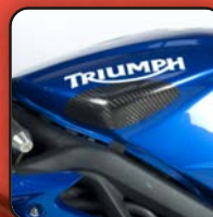
CARBON TANK SLIDERS