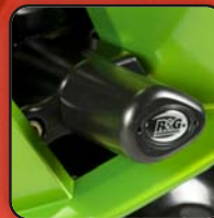
AERO CRASH PROTECTORS