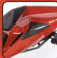
CARBON TAIL SLIDERS